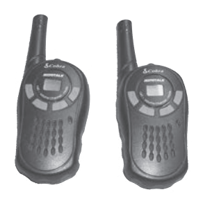
Family Radio Service (FRS) radios

Family Radio Service (FRS) units also operate on line of sight, but the effective range is considerably shorter than GMRS, typically well under a mile. However, the FRS radios don't require a license and are usually more inexpensive.