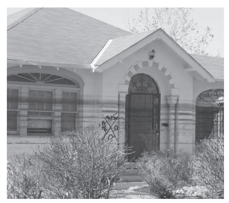
An abandoned-looking home may be just as much of a deterrent to intruders as a heavily fortified one.

The strategy you choose will depend on your location and the circumstances of the actual collapse. If you are in an urban or suburban area, odds are pretty good that you'll have neighbors who will be struggling to survive. You can do anything you want to your home to make it look burned out and abandoned, but these people will know you are still occupying the structure. Unless you can get the entire neighborhood to go along with the ruse, the idea is something of a non-starter.